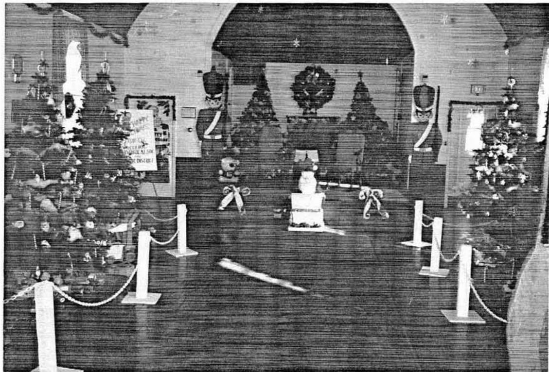
FINISHED Lollipop LANE - WONDERFUL