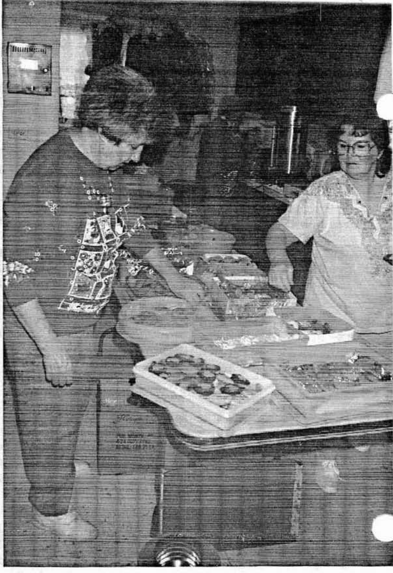
COOKIE DONATIONS - LOOKS GOOD