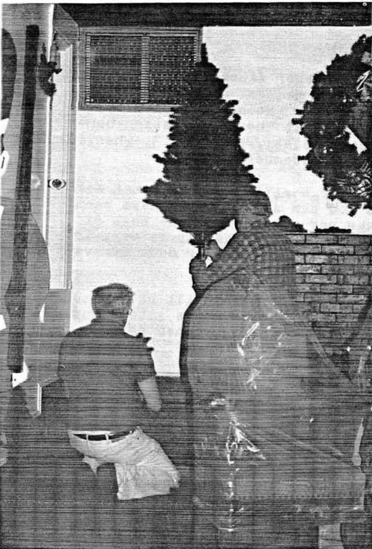
SETTING UP Lollipop LANE MUCH WORK