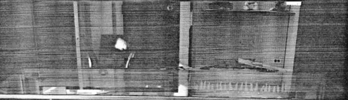
VALENTINE DISPLAY FEB-1995